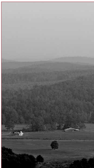
TALLADEGA NATIONAL SCENIC BYWAY